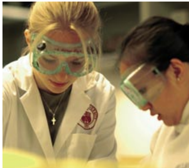
The College of Science and Engineering helps students attain their goals and prepare for opportunities to serve the community.

I give to Seattle University, a Washington non-profit corporation, headquartered in Seattle, Washington, the sum of $ _____ to be used for _____.