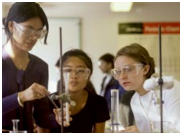
Students experiment in a beginning chemistry class.